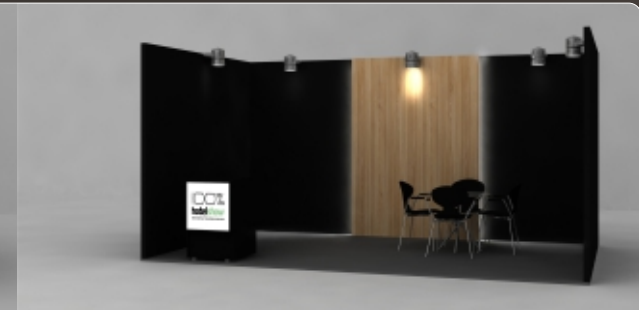
Booth with concealed lighting